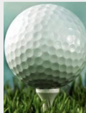
GLMV Chamber of Commerce Annual Golf Outing

Networking 4 Newbies: Networking For Start Ups & Home-Based Businesses Workshop or